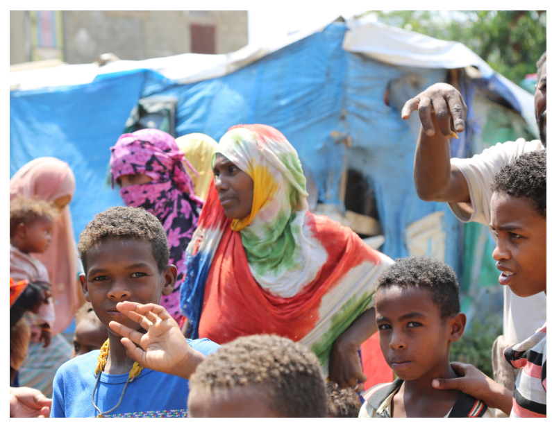
Internally displaced women and children in Taizz