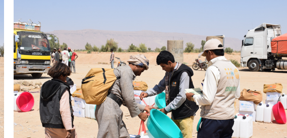
Distribution of RRM kits among displaced families in Al Jawf Governorate