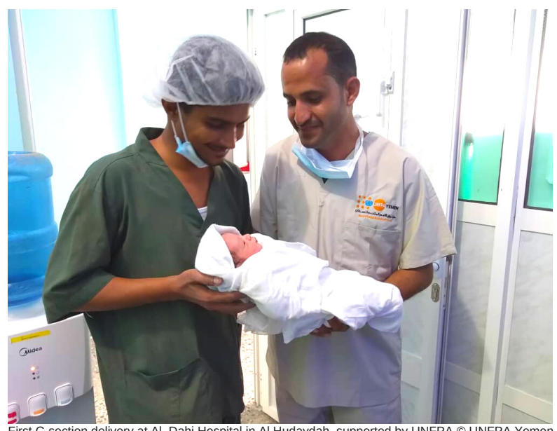
First C-section delivery at Al Dahi Hospital in Al Hudaydah supported by UNFPA