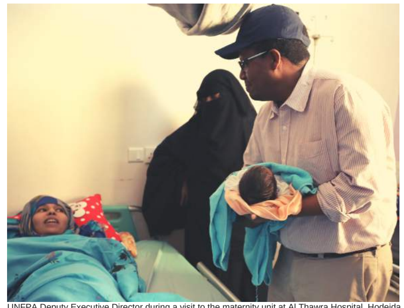
UNFPA Deputy Executive Director during a visit to the maternity unit at Al Thawra Hospital, Hodeida