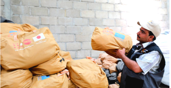
Distribution of RRM kits among displaced families in Aden and Al Dale and Sa'ada Governorates.