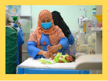
After eight years of conflict and despite a fragile truce, childbirth still a matter of life and death in Yemen Read more...