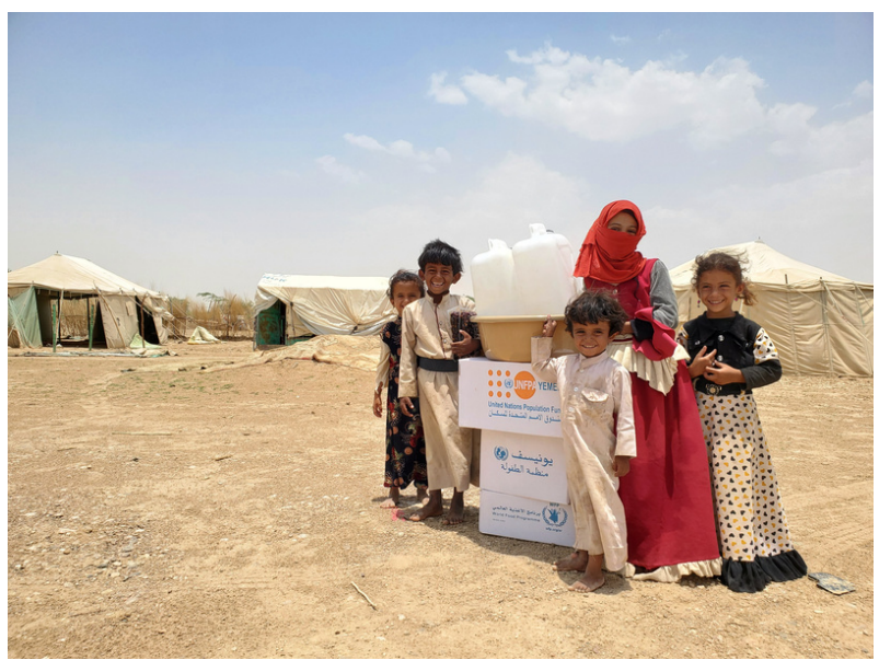
a female-headed newly displaced family with emergency relief items recieved through the UNFPA-led Rapid Response Mechanism at their temporary shelter in Al Jawf, Yemen