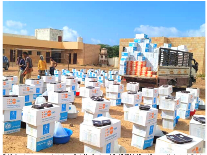
Distribution of rapid response kits to flood-affected families through the UNFPA-led Rapid Response Mechanism in Sa'ada Yemen