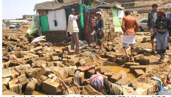
Distribution of rapid response kits to flood-affected families in Sa'ada